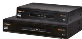
DW-VAONE VMAX® A1™ DVRs