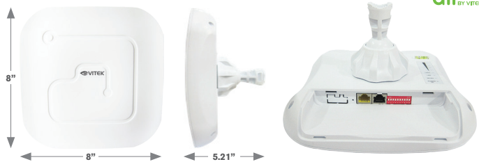
Sleek and compact design, with dual ethernet ports, and easy setup with DIP switch configuration (computer not required).

With high speed transmission of 150MBps and a wireless range of 1.25 miles (2km), the VITEK VT-WB2150 eliminates the need for expensive and troublesome long-distance cables in areas where CCTV monitoring and rigorous surveillance take place. This small, lightweight and durable unit is easy-to-install and easy to use with an innovative and straightforward 10-button plug-and-play dip switch that facilitates the creation of a robust wireless network without a computer. Set-up can be simply configured for point-to-point or point-to-multipoint topology depending on the application, with up to 128 IP group configurations.